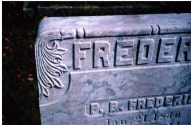
AFTER cleaning with ONLY water