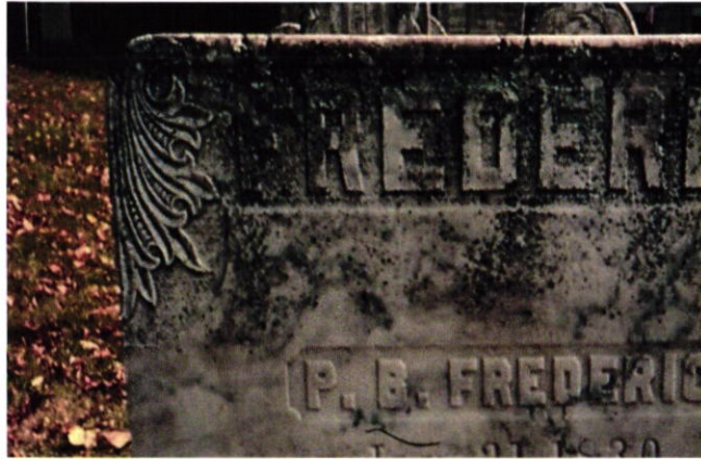
BEFORE cleaning with ONLY water

Cleaning gravestones is a wonderful way to preserve the past, but it is important to clean gravestones the correct way.