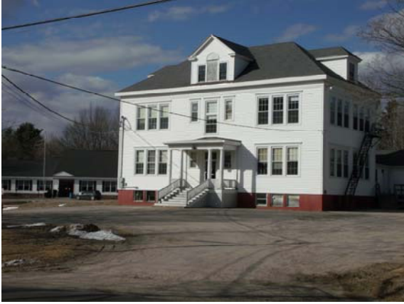
Old Bar Mills Elementary School —a Contributing Building in a DOT National Register Historic District