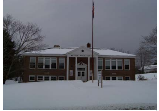
Hollis Learning Center

Work continues to find a solution for disposition of the Old Hollis High School building, a.k.a. Hollis Learning Center. At the July 12 meeting of the MSAD 6 Facilities Committee, there was discussion and consideration of the footprint of the land to be offered with the old Hollis High School in any proposal for the transfer of the building, either to the Town of Hollis (not likely) or in a sales offer on the open market.