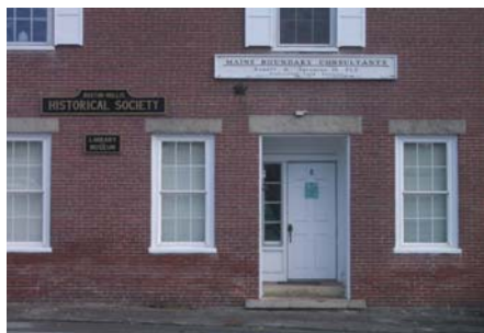
BHHS Museum & Library