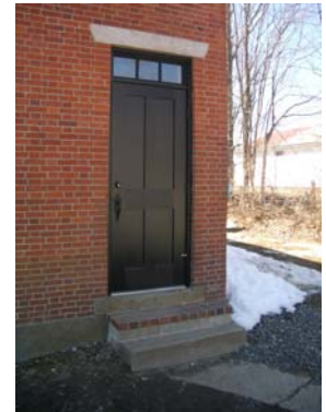
New Door and Transom at Historic Elden Store