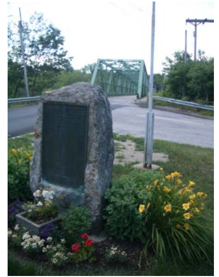
Bar Mills World War I Memorial Bridge, Buxton side in background. Plaque with names of Buxton and Hollis WWI Veterans in foreground.