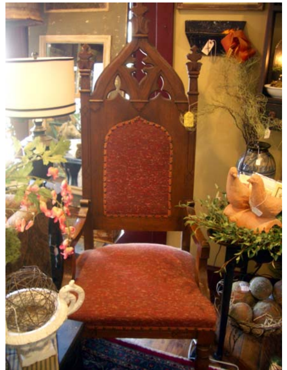
Pythian Sisters Chair

By 2010 the order was unable to continue its activities because of a declining and aging membership. They made the difficult decision to disband and gave their building and land to the food co-op, assuring it a permanent home. There was enough money to