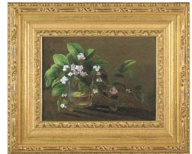
“Mayflowers in Glass Tumbler”