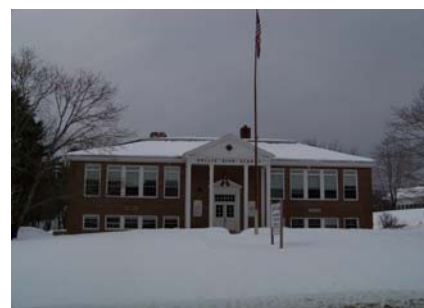
Hollis Learning Center