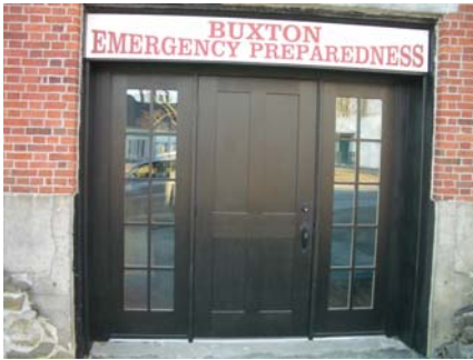
New Emergency Preparedness Entry

The BHHS Board, working with the approval of the Buxton Selectmen, decided to first concentrate on the exterior of this historic building located in Buxton Center at what was Buxton's first major industrial area in the 1800's and what is now a visible corner on heavily traveled Route 22. Since then, the old Elden Store, which houses the Town's Emergency Preparedness Office in the basement, has been given a complete new entrance door unit with lovely side lights for that basement space and a new single door (complete with new custom wood transom) on the Route 22 side. In addition, new double doors have replaced the door opening previously filled with plywood on the Haines Meadow side. Both the exterior (and interior) window frames and sash have been painted and volunteers have made and hung new curtains to replace the tattered ones. Landscape Designer, Theresa Mattor, of Hollis, was hired by the Society to create a traditional landscape design of historic feeling with traditional walkways, trees and plantings, along with input and approval from the BHHS Board and Buxton Selectmen.