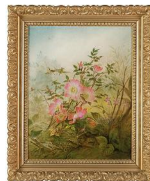
"Wild Roses & Hummingbird"